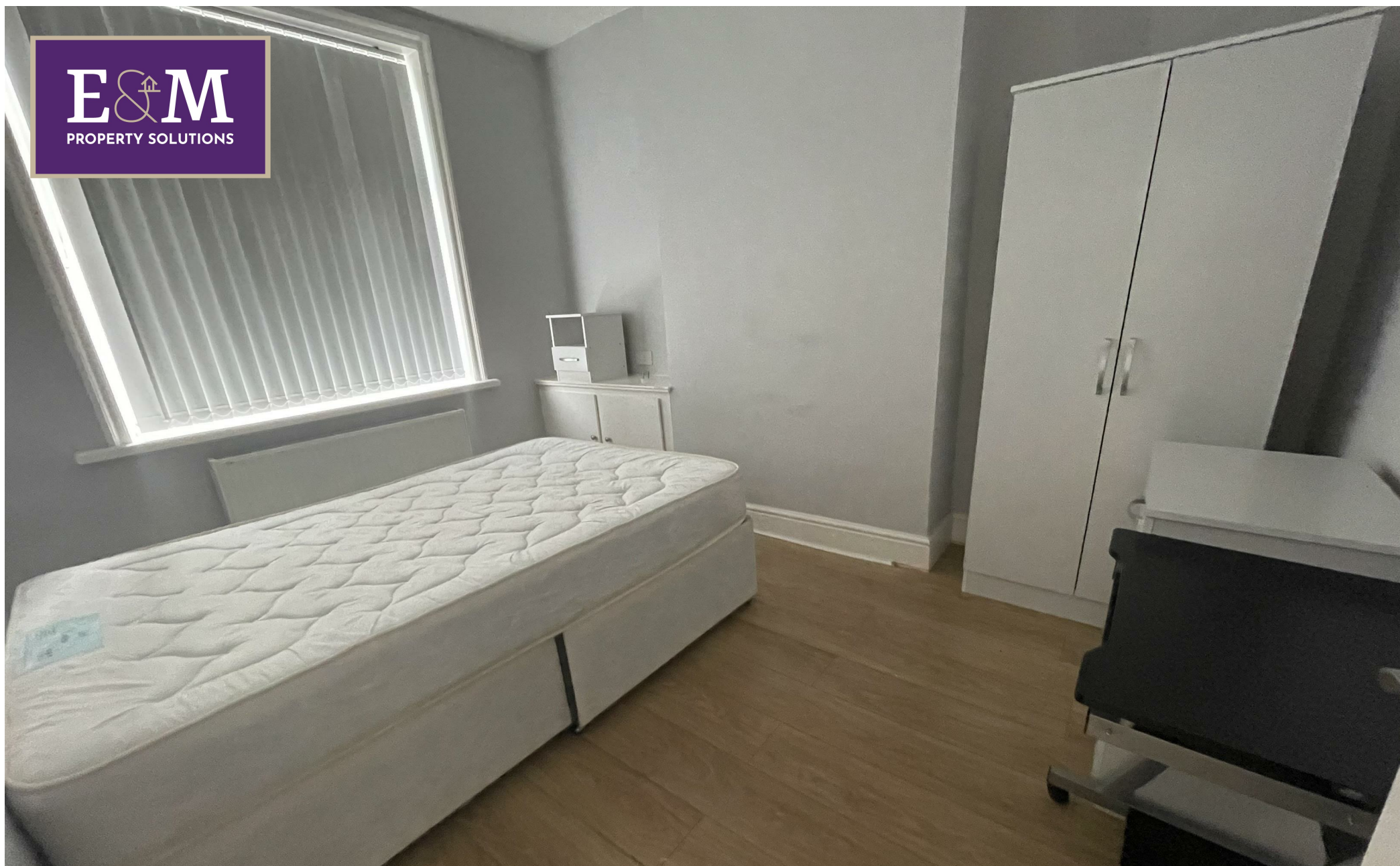
ROOM 1, 16 Harley Street, Burnley, Lancashire, BB12 6RJ £95 Per week